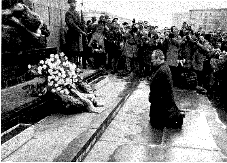
German Chancellor Willy Brandt knelt before the monument to the Warsaw Ghetto Uprising, Warsaw, December 7, 1970.

In the words of Brandt, “He who forgets or seeks to forget will become sick in his soul.” Elie Wiesel, Holocaust survivor and Nobel Peace laureate, once said, “If we forget, the dead will be killed a second time.” He further noted, “If we forget, we are guilty, we are accomplices. The rejection of memory . . . would doom us to repeat past disasters, past wars.” The juxtaposition of Japan and Germany is sobering: both murdered other nationals or ethnic groups, and were defeated in the Second World War, yet the polar opposite ways in which they dealt with their past atrocities are deeply thought-provoking. As for the successive Chinese governments, those slaughtered 30 years ago at the hands of martial law troops obeying orders were their fellow countrymen of the same race and ethnicity. In the face of such criminality and facts, can the government look the other way forever?