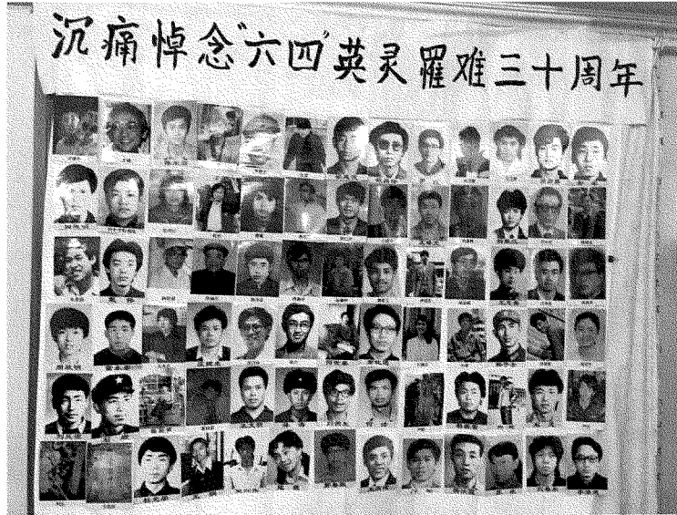
Thirtieth anniversary commemorative shrine honoring those killed in June Fourth.

and the murderers be held accountable. Over the last 30 years, we have never given up, never stopped searching for those who share our fates, and never surrendered to our tragic lot. Through our mutual support and assistance, we built consensus in our difficult journey, and came together to form the Tiananmen Mothers. This unique community of sufferers, whose fates are bonded by June Fourth, has been steadfastly guarding your spirits in the storm.