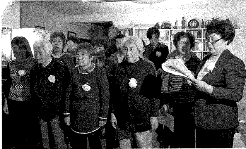
Members of the Tiananmen Mothers reading their essay, "Mourning Our Families and Compatriots Killed in the June Fourth Massacre"

The second option is to learn from Willy Brandt and face history head-on by taking the following actions: Express remorse for the government's past crimes; hold sincere dialogue with June Fourth victim groups; resolve June Fourth through legal procedures; publicize the truth and number of casualties of the massacre; provide compensation for the victims; and conduct just trials of those responsible for the killings. Taking these measures will usher in a new era in which the tragedy of June Fourth will not be repeated. We the Tiananmen Mothers, the guardians of the souls of June Fourth, eagerly await the arrival of the new era!