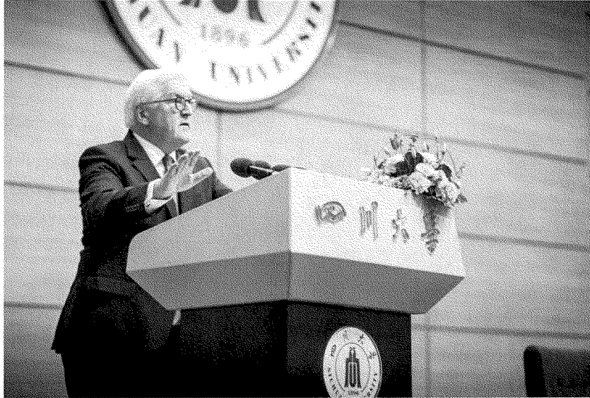
German President Frank-Walter Steinmeier giving a speech at Sichuan University, December 8, 2018. Source.

To our knowledge, Václav Havel, the late former President of the Czech Republic, along with several Nobel Peace laureates and many unnamed others, nominated the Tiananmen Mothers for the Nobel Peace Prize multiple times to encourage us to carry on with our mission. We will not forget the invaluable humanitarian concern we received in our most difficult times from officials in foreign embassies in Beijing as well as journalists of many Western countries such as the United States, Great Britain, Germany, France, and Sweden.