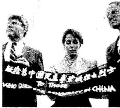
Nancy Pelosi as U.S. Congresswoman in Tiananmen Square with banner: "To Those Who Died for Democracy in China." September 1991. Source.

As early as 1991, two years following your martyrdom, Nancy Pelosi, then U.S. Congresswoman and now Speaker of the House of Representatives, came to China. Under the glare of armed police standing guard in the streets, Pelosi courageously came to Tiananmen Square—where you had fallen—to unfurl a banner that reads, "To Those Who Died for Democracy in China."