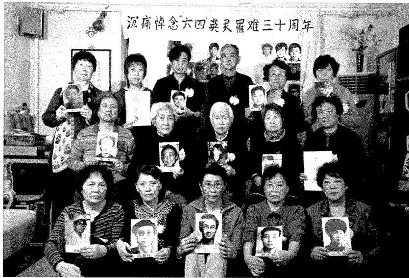
Members of the Tiananmen Mothers with photos of their loved ones killed in June Fourth.

[English Translation by Human Rights in China]