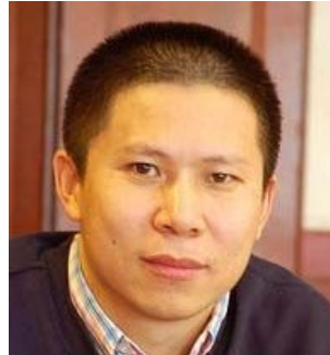
Xu Zhiyong Civil Society, Expression Tried, awaiting sentencing