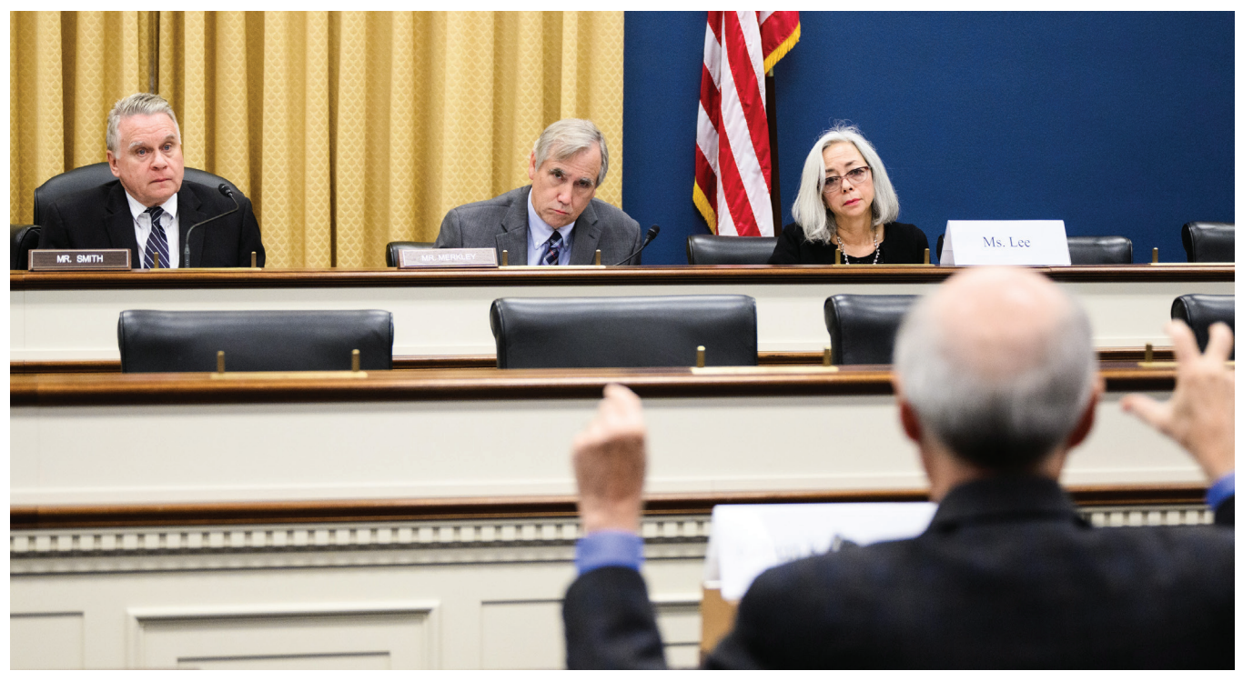
Commissioners listen to witness testimony at the October 24, 2023, hearing entitled "From Bait to Plate—How Forced Labor in China Taints America's Seafood Supply Chain."